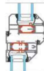
Vent / Transom Detail